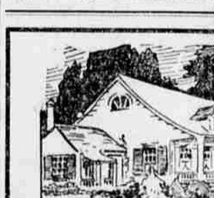
Mountain States Power Co. 881 Oak Street Phone 28

Let Gas be the Finishing Touch That Will Assure Your Home Comfort. Of course the new home will be piped for gas! It's almost as essential for comfort and convenience as doors and windows and a roof. If you're building this summer, notify us now. Or if you intend to have "the old nest" made modern and up-to-date with Gas Service, let us know. Call at our office and let us demonstrate new Vulcan Smooth Top Gas Range. Free estimates on any installation—new house or old. Just phone 28, or come into the office.