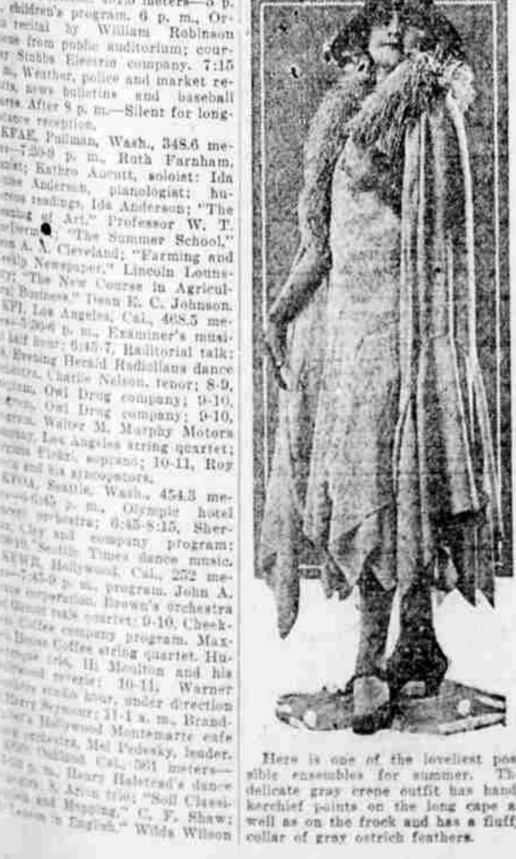
Here is one of the loveliest possible ensembles for summer. The delicate gray crepe outfit has handkerchief points on the long cape as well as on the frock and has a fluffy collar of gray ostrich feathers.