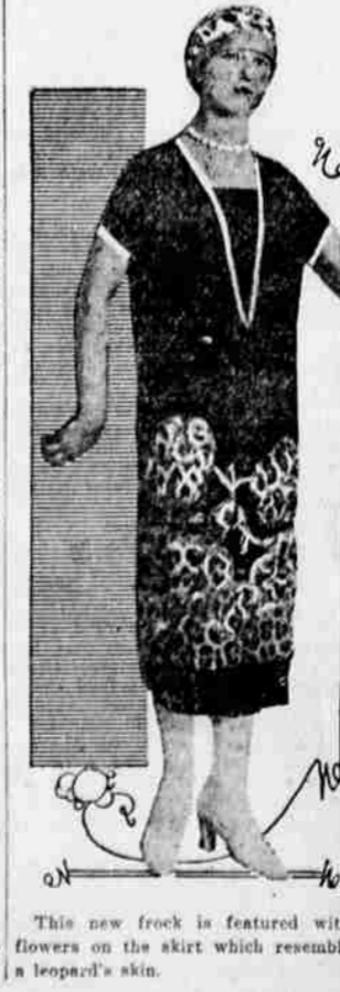
This new frock is featured with flowers on the skirt which resemble a leopard's skin.