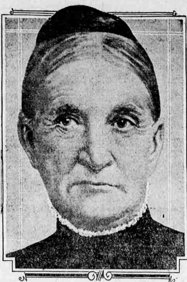
Mrs. Henrietta King, owner of the largest ranch in the world, comprising 1,260,000 acres of land in Texas, who died at her home Tuesday night.