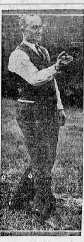
Here is Ty Cobb, famous baseball celebrity, in a new role, that of horseshoe player. Cobb tried to ring a few while vacationing at Augusta, Ga., recently.