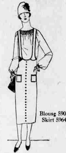
Blouse 5903 Skirt 5964

The Deltor included with the Butterick Pattern shows you with pictures how to smock the blouse.