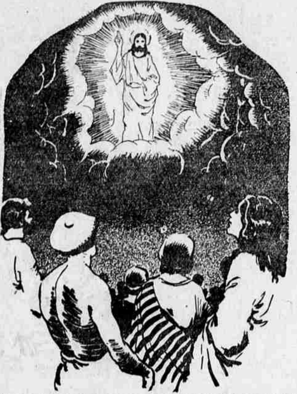
TEXT: Luke 24:36-53.

It does seem a mistake, however, to base largely upon a single passage such hopes of a return of Jesus