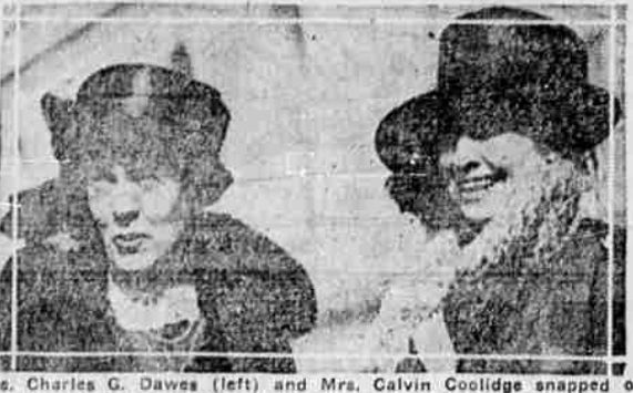
Mrs. Charles G. Daves (left) and Mrs. Calvin Coolidge snapped on the streets of Washington while preparations for the inauguration were going on.