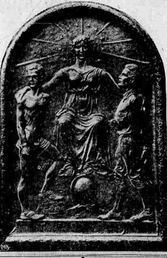
One of the prize-winning exhibits of the sculptors' exhibition at Boston, Mass. Its inscription reads: "Know'at thou when Fate thy measure takes, or when she'll say to thee, I find thee worthy—do this deed for me."

of poetry through the different ages and will now learn about famous authors and their works.