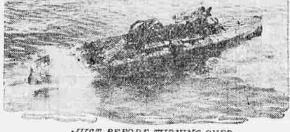
JUST BEFORE TURNING OVER