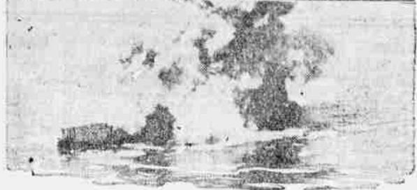
1100 LB BOMB FINDS ITS MARK