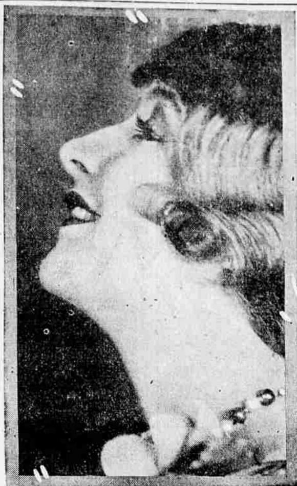
By MILDRED HARRIS Screen Star and First Wife of Charlie Chaplin

At Least First Spouse Thinks So; Mildred Harris Tells Her Views Of Famous Little Comedian's Love Affairs