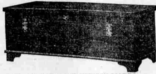
THE NEW "PACIFIC" MODEL Solid copper trimmed, length 54 inches. $24.00

A most interesting exhibit of 14 new models from the Far West Manufacturing Co.