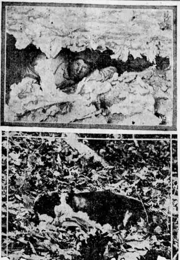
The remarkable photo above shows Floyd Collins in a crevice of Crystal Cave, in exactly the position in which he was trapped in Sand Cave, near Cave City, Ky. It was taken just before he entered Sand Cave. Below, Collins' dog is shown mourning for him near the mouth of the cave. It has refused comfort since he was trapped.

Flash Taken in Crystal Cave Shows How He Was Trapped Later in Sand Cave, Kentucky; Dog Mourns