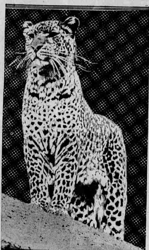
This big spotted cat, who can't change his spots, is certainly an elegant looking fellow. While, frankly, he's not a vegetarian, he isn't as black as some have painted him. It is easy to see that whatever his faults may be, he's a perfect gentleman; something on the order of the mildest man that ever scuttled a ship or cut a throat.

Big Spotted Cat, While Not a Confirmed Vegetarian, Isn't Really So Bad as He's Sometimes Said to Be