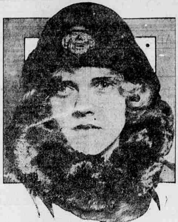
That's the latest fad for the ladies. It is a face about an inch in diameter, of a pierrat, a clown or any other amusing character. Sometimes it is painted, sometimes flat, sometimes in relief, sometimes it has real hair. They are attached to the hat, as shown in photo, or on purses or handbags.

Sometimes Also They are Attached to Purse or Handbag for Display by Milady When she Walks Abroad.