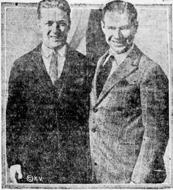
Left to Right, Loren Murchison, Charley Paddock. Charley Paddock, famous sprinter, is nothing if not original. He is a firm believer in doing things just little different. In company with Loren Murchison, an almost equally famous runner, he has arranged for a world tour that will give them a chance to spread the gospel of athletics in many countries where it now receives little or no consideration.

Paddock And Murchison To Spread Gospel Of Athletics In Countries Where It Now Gets Little Attention