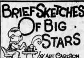
Q. H. "BABE" RUTH