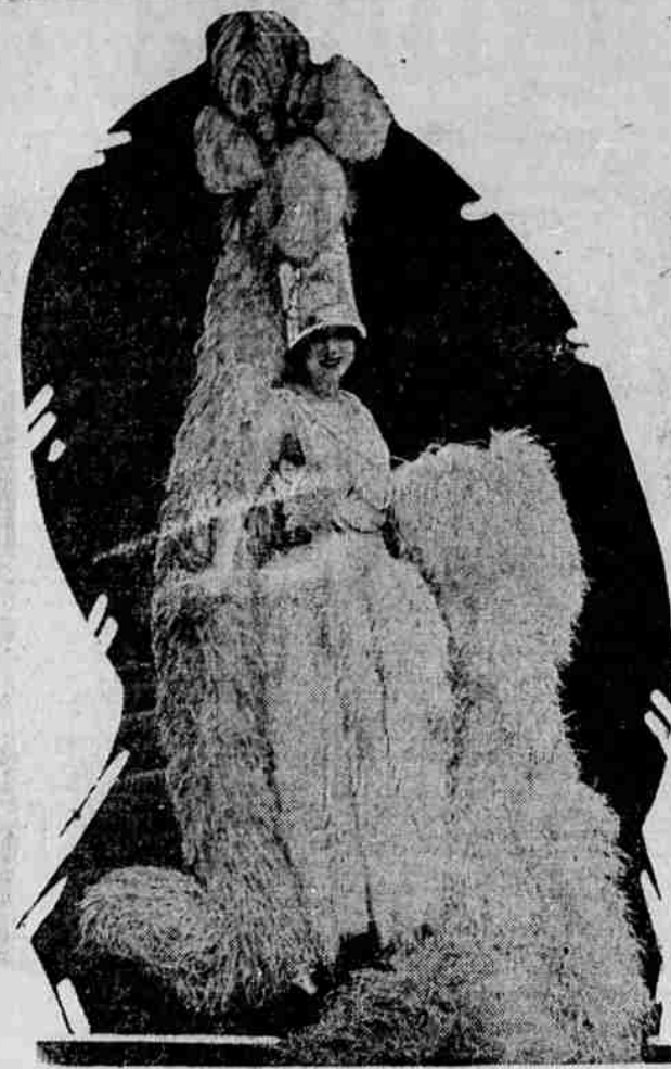
Mlle. Mistinguette, the French musical revue star, who has been on an American tour, has returned to the Casino de Paris in a blaze of ostrich plumes. It cost 100,000 francs to find enough ostriches