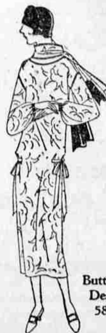
Butterick Design 5832