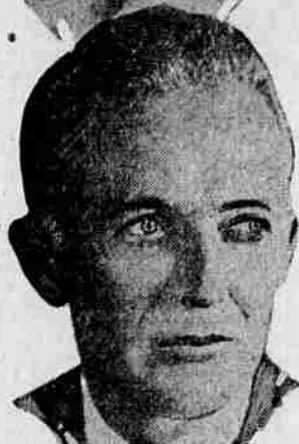
DIANA MILLER & GEORGE MELFORD

Diana Miller, star of the silent drama, has been reported engaged to George Melford, motion picture photography director. Both admit they intend to be married, but keep the Hollywood film colony guessing by refusing to name the date.