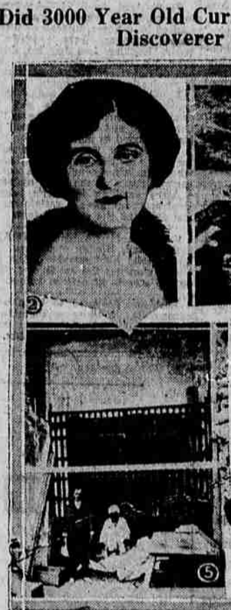
The curse of 3300 year old Pharaoh is said to have caused the death of the noted British discoverer of the tomb of Tutankhamen. The above layout shows the principal figures and scenes of this interesting story.