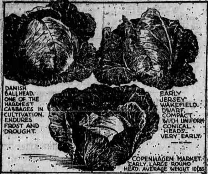
DANISH CALL HEAD. ONE OF THE HARDEST CABBAGES IN CULTIVATION. ENDURES FROST AND DROUGHT.