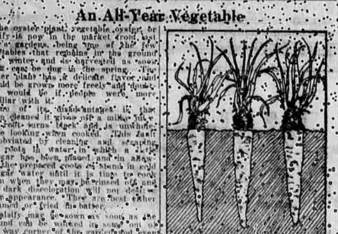
CALSIOP OR VEGETABLE OYSTER. CULTIVATE SAME AS PARSNIPS. CAN BE LEFT IN GROUND THROUGH WINTER. WANTED FOR TABLE USE.

The oyster plant, a vegetable, is a highly popular in the market. It is a highly yielding plant and is easy to grow.