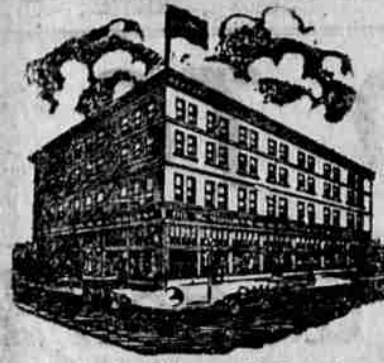
New York Office, 1170 Broadway

—Buy father or brother a new suit with an extra pair of pants for Christmas. These suits are pure wool well tailored and in brown and gray striped patterns—size 36 to 42 and several suits of each size. A very exceptional offer for Thursday and Friday.