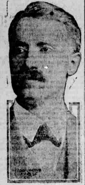
Speaking for the Shipbuilding Board and the Emergency Fleet Corporation, Bainbridge Colby, a member, told a Senate committee that bone dry prohibition, taking the beer of the workmen in shipyards from them, would decrease the shipbuilding program by 25 per cent.

west half of the northwest quarter of Section 13; and Lots 1 and 2 of Section 11; also commencing at the southeast corner of the Donation Land Claim of H. C. Owen and wife, Nott. 5375 Claim No. 40 in Sections 1, 2, 11, 12; thence west 41.80 chains; thence north 47.84 chains; thence east 41.80 chains; and thence south 47.54 chains to the place of beginning; also the fractional northeast quarter of Section 14 and the fractional north half of the southeast quarter of