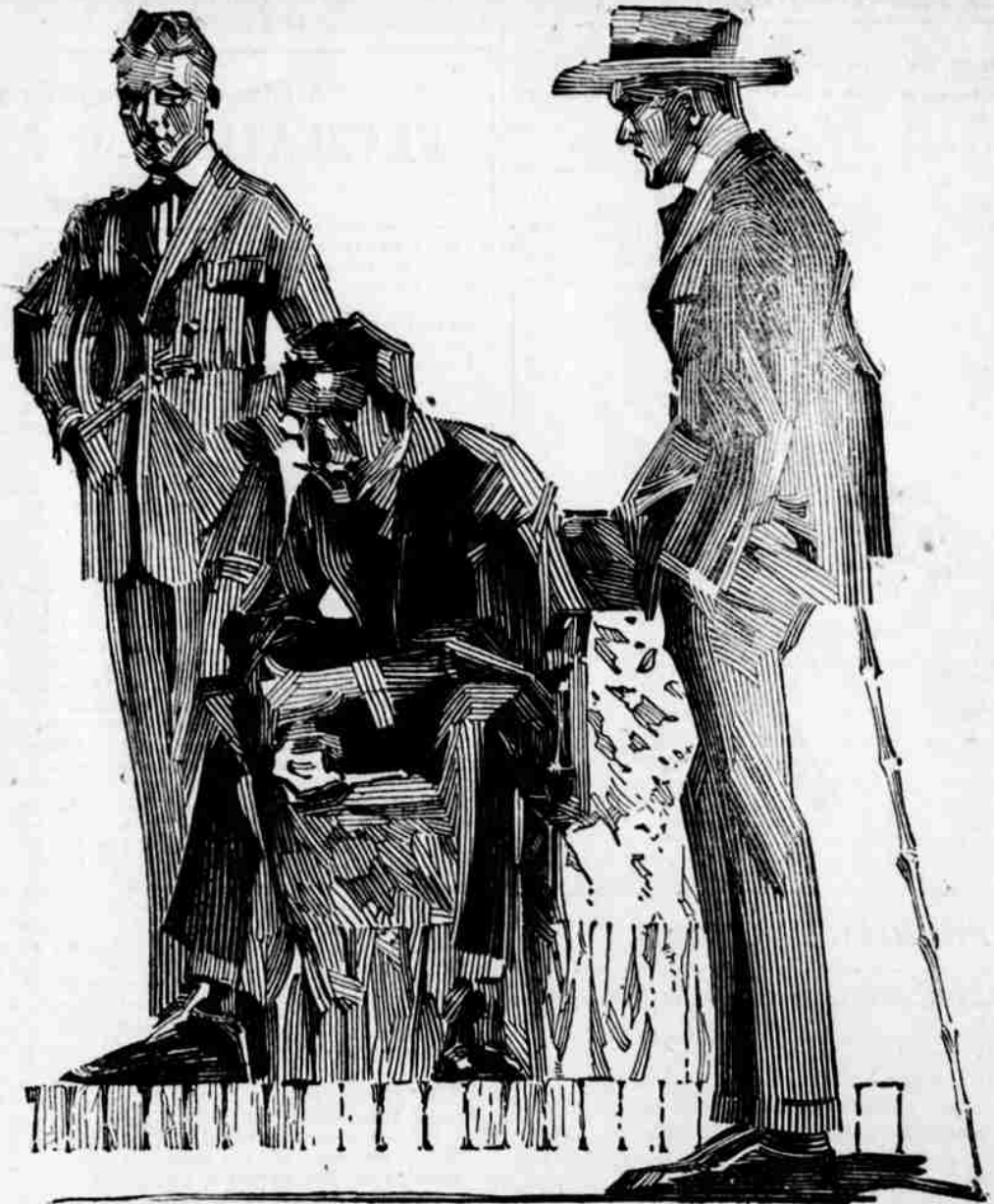
Copyright 1918 Hart Schaffner & Marx