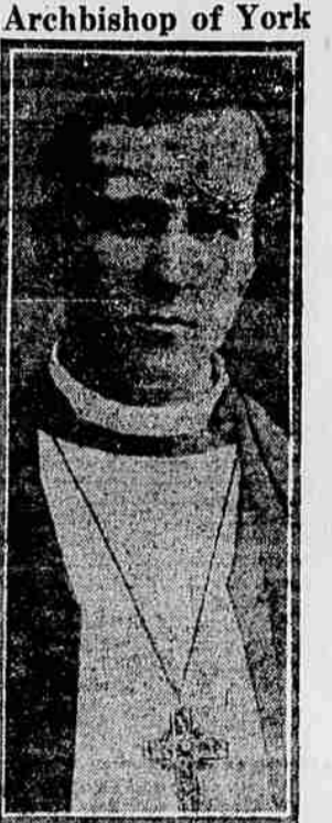
ARCHBISHOP OF YORK

The Right Honorable and Most Reverend Cosmo Gordon Lang, archbishop of York, will come to the United States in 1918 to preach during Lent at Trinity Church in New York City. He will probably speak in other parts of the country in an effort to further the friendly feeling between the United States and Great Britain.