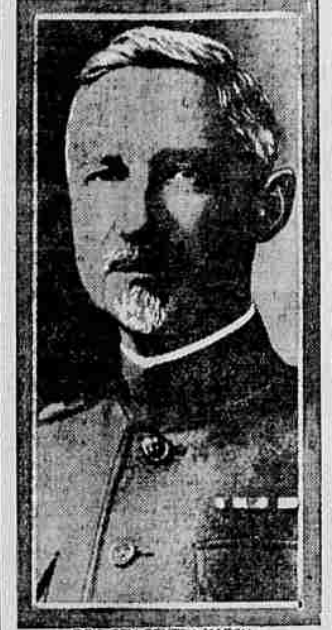
Brigadier-General Peyton March has been designated by the War Department as chief of artillery for the American Army now in France. He will have charge of every type of ordnance used in siege operations.