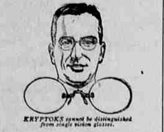
KRYPTOKS cannot be distinguished from single vision glasses.