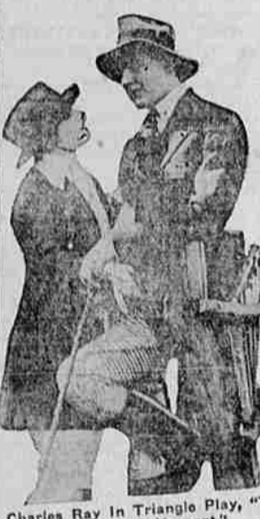
Charles Ray in Triangle Play, "The Millionaire Vagrant."

It's a Triangle-Ince Drama—Brimful of Action, Thrills and Surprises