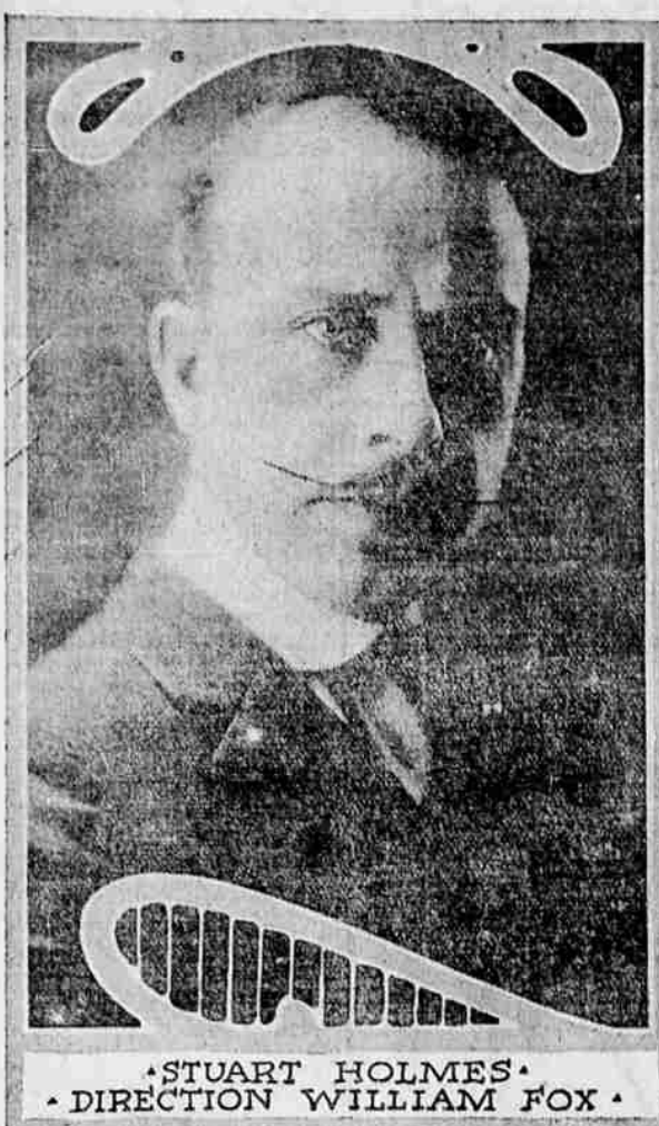
STUART HOLMES - DIRECTION WILLIAM FOX