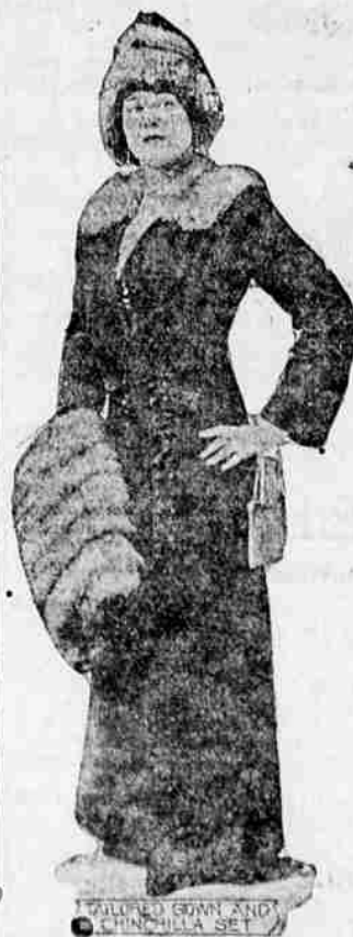
TAILORED GOWN AND CHINCILLA SET

This oddly cut tailored gown gives one a good idea of the way buttons are being used. These are silk covered ball buttons, matching the dark brown of the dress. The skirt is slashed, and the coat has a novel arrangement of the revers, that on the left wing being very wide and shaped to the figure by means of narrow tucks. With the gown is worn a brown velvet turban trimmed with a band of tawny Australian chinchilla. The collar and pillow muff are also of chinchilla.