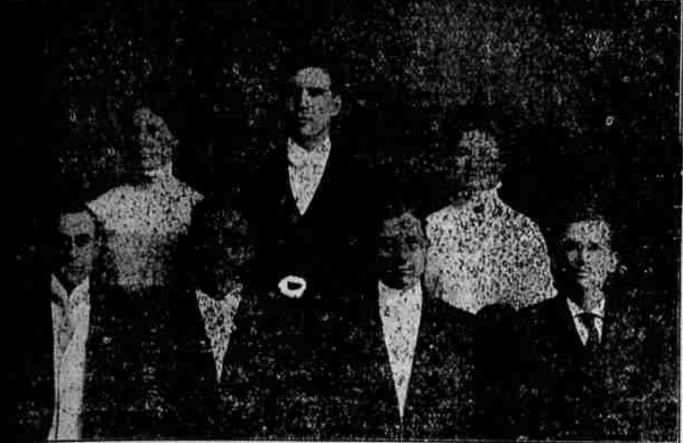
SENIOR CLASS OF EUGENE BIBLE UNIVERSITY

The Eugene Loan and Savings Bank CAPITAL AND SURPLUS ONE HUNDRED AND TWENTY-FIVE THOUSAND DOLLARS EST. 1858