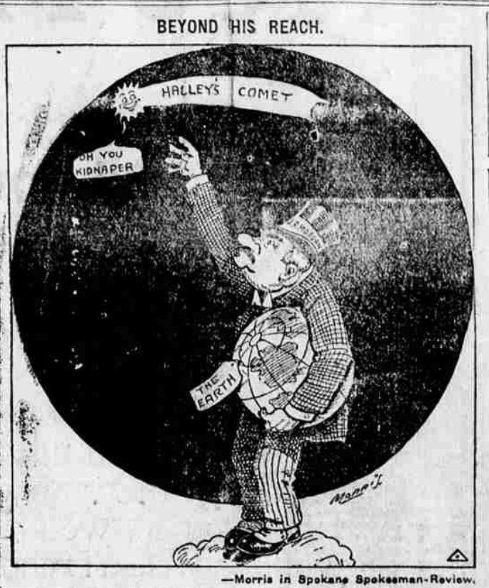
—Morris in Spokane Spokesman-Review.