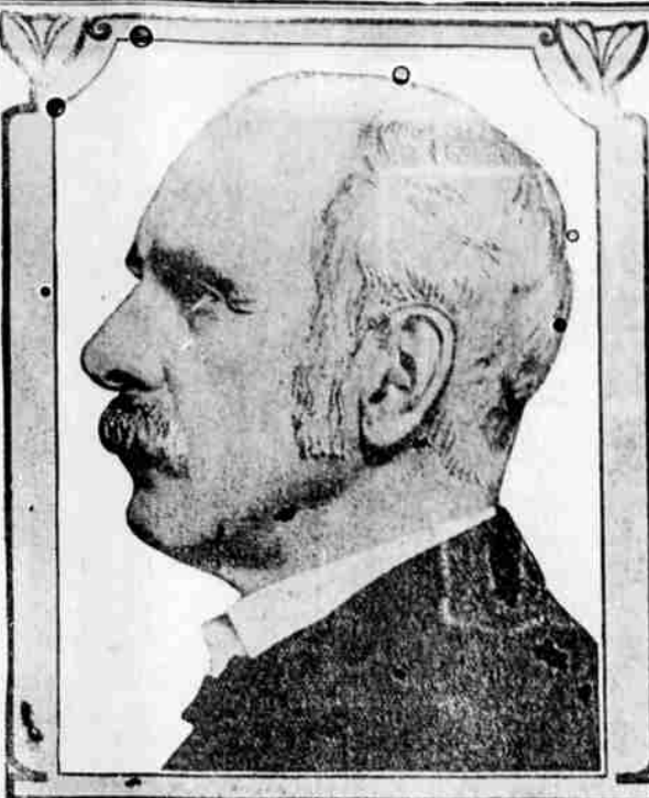
LESLIE M. SHAW, FORMER SECRETARY OF THE TREASURY.

PILES CURED IN 6 TO 14 DAYS PAZO OINTMENT is guaranteed to cure any case of Itching, Blind, Bleeding or Protruding Piles in 6 to 14 days or money refunded. See