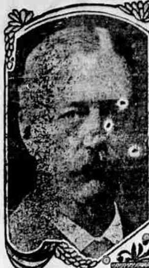
ABBOTT L. LOWELL. The successor of Charles W. Elliot as president of Harvard university is a graduate of the university, class of 1877, and has been connected with Harvard officially since 1897.

According to that speech, the President is opposed to the adaptation of the colonial policy in the opening of China. To him the "open door" has a broad meaning, which unselfishly looks beyond the possibilities of trade to the future life of the empire.