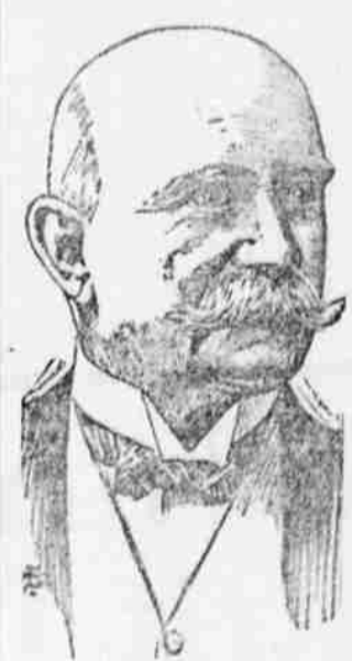
COUNT VON ZEPPELIN