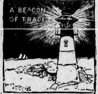
A BEACON OF TRADE