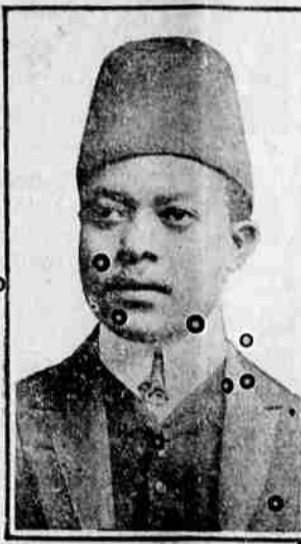
SULTAN OF ZANZIBAR. Seyid Ali Ben Hamud, sultan of Zanzibar, who lies on the east coast of Africa, was born June 7, 1884, and succeeded his father, the late Hamud Ben Mohammed, in 1902. He rules over a population of 250,000, principally negroes.

Mutinous Soldiers surround the Building of Parliament. Constantinople, April 13.—The cabinet has resigned and its resignation has been accepted. It is reported that Kiamil Pasha, former grand vizier, has been charged with the formation of a new ministry. Constantinople, April 13.—Serious disturbances of a revolutionary character have broken out here and the