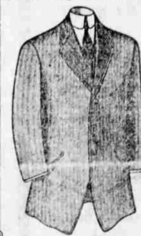
Our Fashion 562 Three-Button Novelty Sack, Dip front, curved pockets.

Examine our Spring fabrics, the prettiest ever shown in this community, and our original fashion designs. Be among the first to proclaim a new style. We agree to please you or refuse your money.