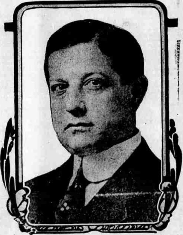
J. A. HEYDLER, ACTING HEAD OF NATIONAL BASEBALL LEAGUE National League managers and players to a man have the most sincere respect for J. A. Heydler, who is acting as president of the league during the absence of President Pulliam. Mr. Heydler's long association with professional baseball fits him for the important post, and he is a sportsman of the highest ideas of equity and fairness.

Formerly The Old Wells Shoe Store Corner Willamette and Ninth Sts. LOOK FOR THE RED SIGNS