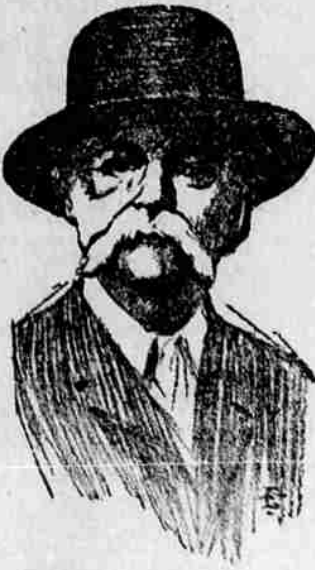
EDWARD PAYSON WESTON.

New York, March 13.—Edward Payson Weston, the famous pedestrian, will be seventy years old Monday and he plans to signalize the anniversary by starting on a walk from this city to San Francisco. The feat will be undertaken in fulfillment of a promise made 30 years ago when Mr. Weston won the Astley belt with a record of 550 miles