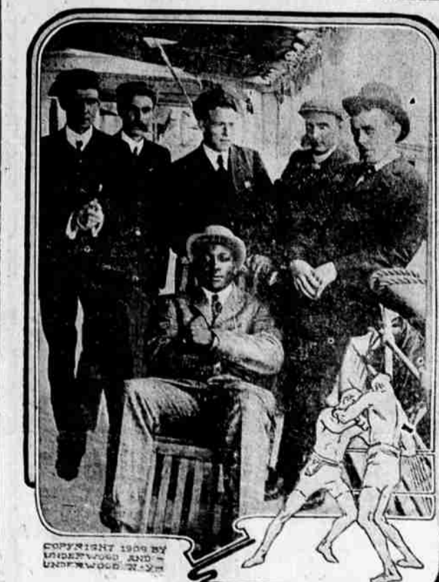
JACK JOHNSON IN HIS ENGLISH CLOTHES.