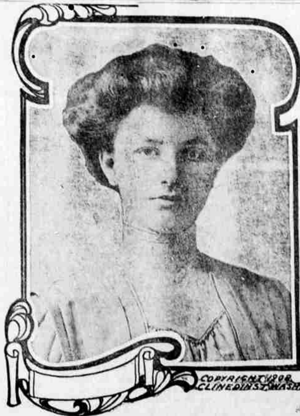
LATEST PORTRAIT OF MISS HELEN TAFT.

Chicago, Dec. 14.—Dec. 11: 90¢; May, 1.05; July, 97 5-8; Sept. gation has not gone far enough to determine all the facts, but it appears that all members of Co. B must have been actively concerned, either to the extent of being participants or encouraging the participants; that the facts were concealed because of dire threats made by those actually engaged in the shooting, and he believes some allowance should be made for the misconduct of those who shielded the perpetrators who may now come forward and truthfully tell what happened, and recommends the reinstatement of such soldiers within one year.