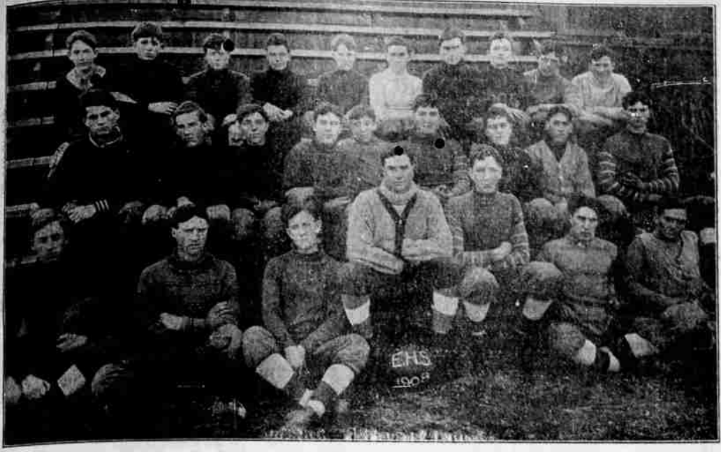
EUGENE HIGH SCHOOL'S FIRST AND SECOND FOOTBALL SQUADS.

The team has not been defeated by any team this year. It plays at Salem next Saturday to decide the championship of the W. O. I. A. also of the state. The Eugene rooters will run an excursion train to Salem on this date and expect to have two hundred support people and white in Salem next Saturday.