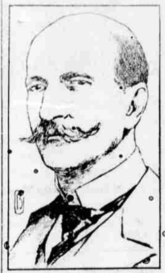
KING GEORGE OF GREECE. "King of the Hellenes" is the official title of George of Greece, who is not a Greek at all, but of Danish blood. He is a son of the late King Christian of Denmark and a brother of Queen Alexandra of England.