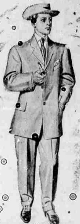
The Clothing of men's Rochester Famous