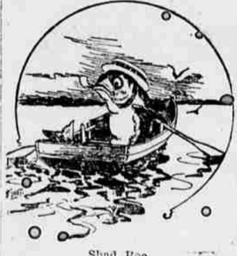
Shad Roe. Has No Kick Coming.