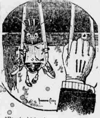
Not to His Liking.