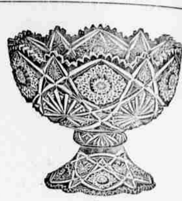
No piece without this Trade Mark engraved upon it, is genuine.

We have the largest stock of Cut Glass ever shown in Eugene, consisting of Hawks, Libbey, Empire and four other reliable makes. We are not going to quote prices here; all we ask is that you come and see the stock and if you are interested you will buy.