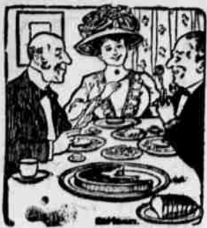
A NICE LITTLE MEAL AT THE THEATRE CAFE

It is always appreciated, where you get everything so appetizing and toothsome these June mornings, when your appetite is fickle. When you want to treat your friends, your wife or your sweetheart to a meal that is cooked to the Queen's taste, bring them to the Theatre Cafe.