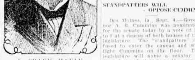
J. FRANK HANLY.

Indianapolis, Ind., Sept. 4.—Republican politics is at the boiling point here tonight over the calling of a special session of the legislature by Governor Hanley and his associates.